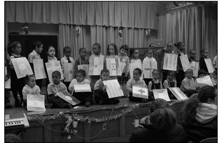
Students from several partner schools demonstrate their musical ability. Clockwise from upper left: St. Brendan, St. Anthony, St. Brendan, P.S. 43, P.S. 155 and St. Athanasius.